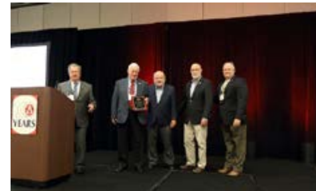
LAGC receives an award for our involvement at the AGC National Convention