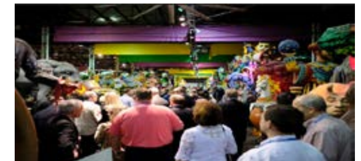
Special Event @ Mardi Gras World