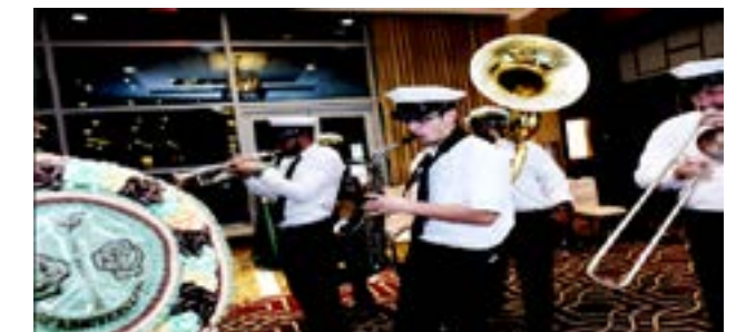
Entertainment at the AGC Convention