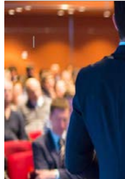
NORTHWEST AREA Shreveport | Monroe | Alexandria