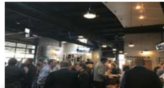
Members enjoying a good time at the Port of Orleans Micro-brewery.