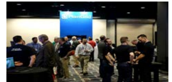
LAGC Member PlanGrid at the Expo