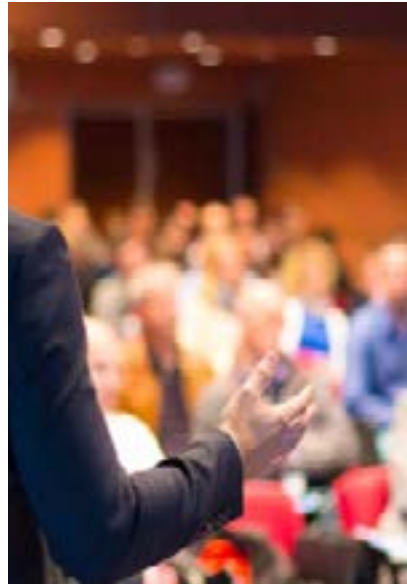
SOUTHEAST Baton Rouge

The Baton Rouge area recently held a meeting with DOTD, the Engineering community and AGC Members to discuss the Design Build process. The department is potentially looking to let several projects using Design Build in the future and AGC was very encouraged to have a voice to discuss the issue. AGC walked away from the meeting