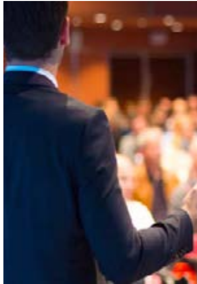
SOUTHWEST AREA Lafayette | Lake Charles